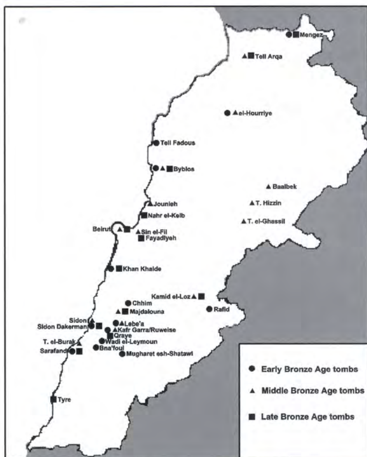
Map showing the main sites.