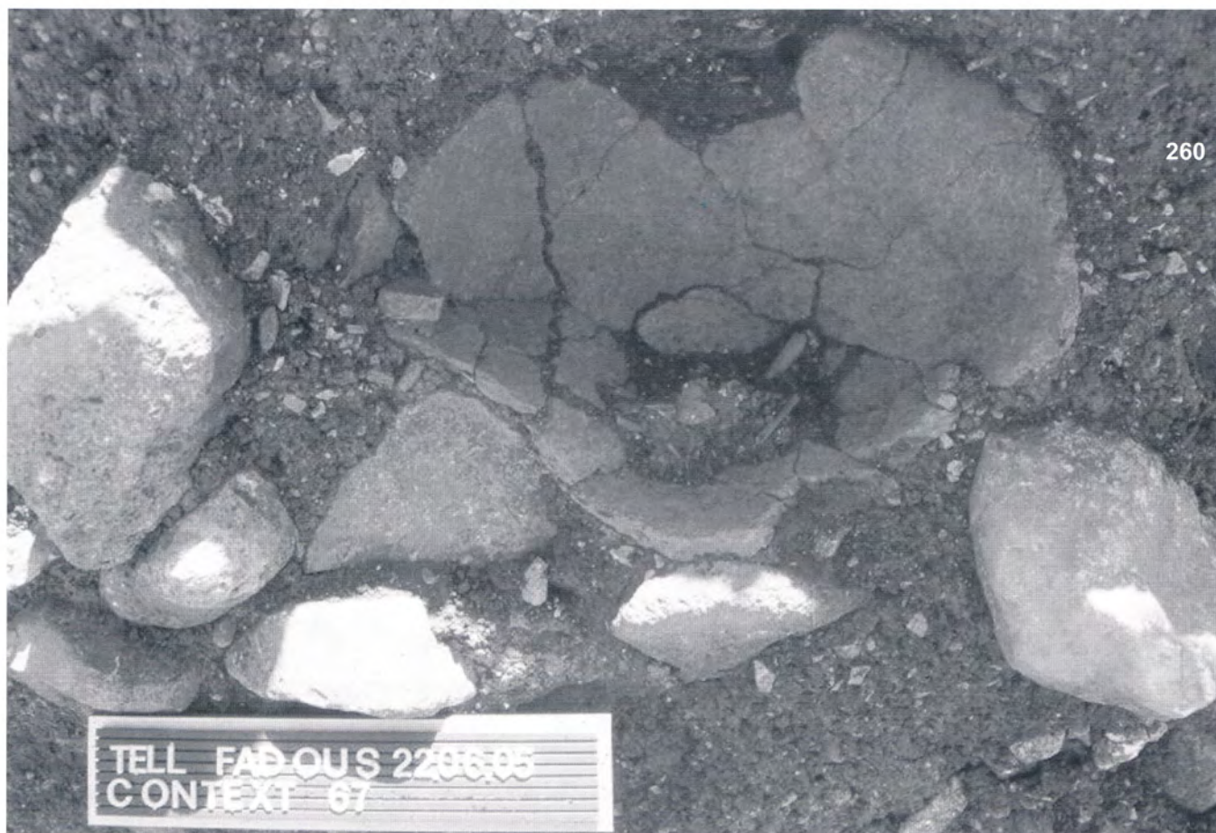
2 Early Bronze Age Jar burial from Tell Fadous Kfarabida (context 67).