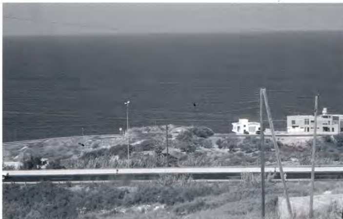
1 Tell Fadous-Kfarabia seen from the east.

The recent investigations at Tell Fadous/Kfarabida (fig. 1) added a new aspect to the EB burial customs in Lebanon. While documenting a section in 2005 two infant burials were discovered, both of them intramural 13 . The jar burial context 67 (fig. 2) consists of the disarticulated bones of an infant aged between 6 and 18 months, which were deposited in a nearly complete cooking pot (fig. 3). This vessel was placed upright in a stone-filled pit. No lid or